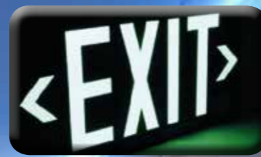
Security System & Emergency Lighting