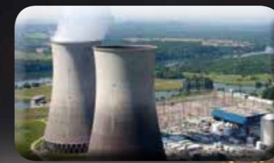
Utilities & Industry